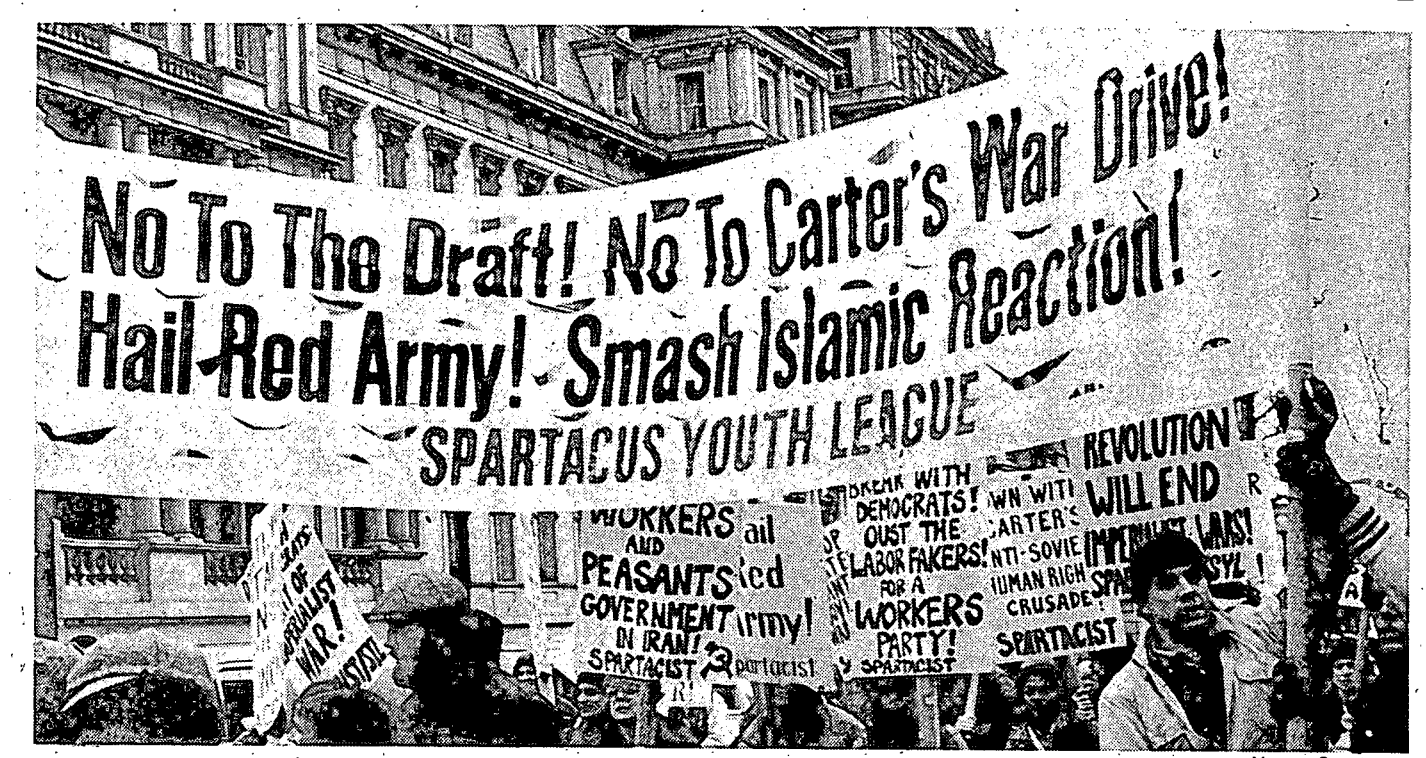
SL/SYL contingent at Washington, D.C. anti-draft demo March 22.