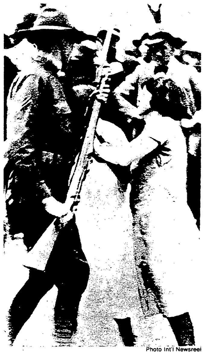
Women strikers resist National Guardsmen during the Gastonia strike, 1929.

organizing of a contingent of black workers in Bessemer City. In contrast, the AFL textile union bent over backwards to accommodate the racial prejudices of numerous white workers in their southern