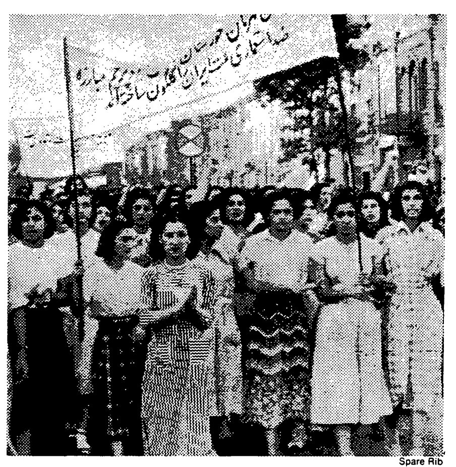
Unveiled women demonstrate in Teheran for nationalization of Iranian oil. 1951.

The laws concerning the status of women passed in the name of the shah's "White Revolution" of 1963 (enacted to counter the threat of a "red" socialist revolution) made little more than cosmetic changes in the Islamic law code. Higher education was made coeducational (approximately 17 percent of university students are now female); women were drafted into the army and sent, as part of the literacy corps, to teach in villages; Western dress was officially approved and the veil discouraged. But these advances were generally limited to the upper classes and left the masses of Iranian women untouched. Moreover, the most elementary bourgeois democratic rights were never achieved by any women. To this day Iranian women still need their father's permission to marry and their husband's permission to take a job outside the home and to travel outside the country. Muslim women may not marry non-Muslims. In many cases a woman is counted as half a man. For instance, a woman inherits only one-half of what her brother does. Two women witnesses can substitute for one man witness and, in certain cases, such as divorce, no female witnesses are