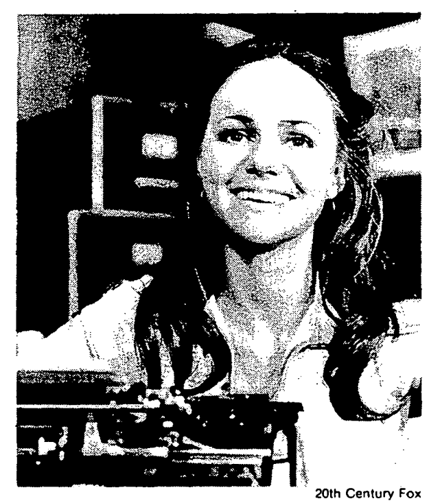
Norma Rae becomes a class-struggle heroine but never acquires a class-struggle program.

In general, Reuben doesn't have too much to say to the mill workers. His "line" starts with "Good morning" and usually ends there. But he has plenty to say to the