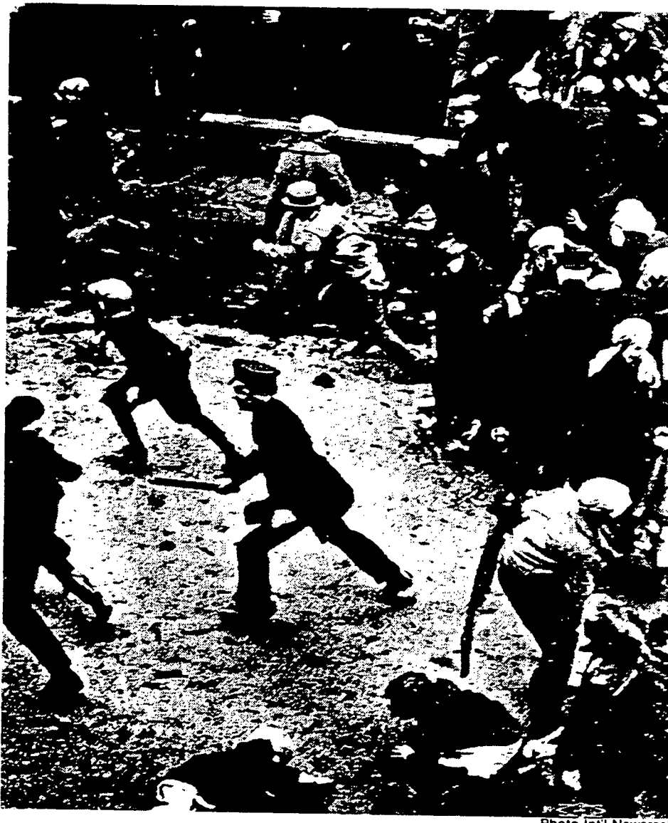
The 1926 textile strike in Passaic, N.J. involving 20,000 workers put the Communist Party on the map of the U.S. labor movement.

Under these extremely difficult conditions, the massive proletarian uprisings in the textile industry (a major employer of women) led by the CP are