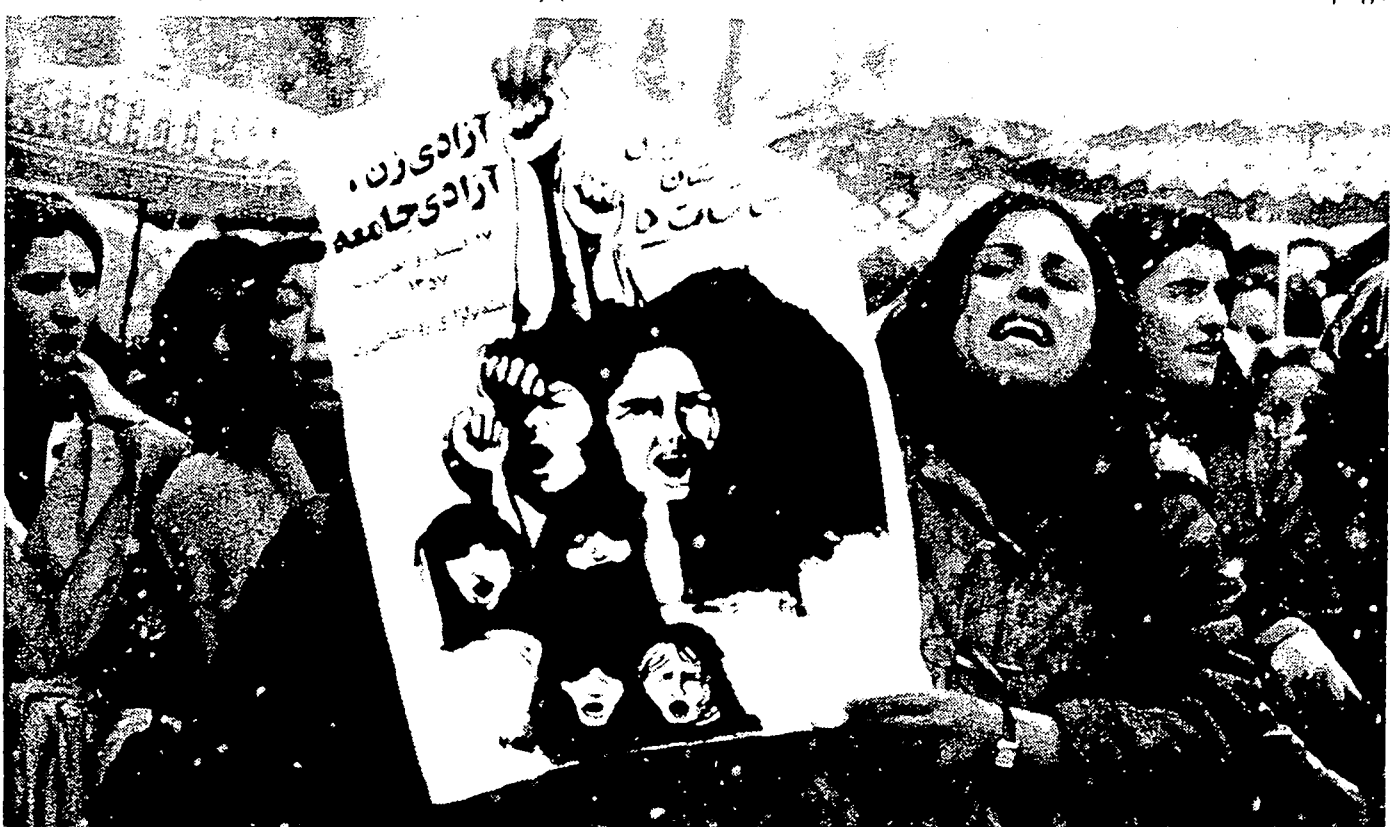
International Women's Day 1979: Tens of thousands march through Teheran chanting, "In the dawn of freedom there is no freedom!"