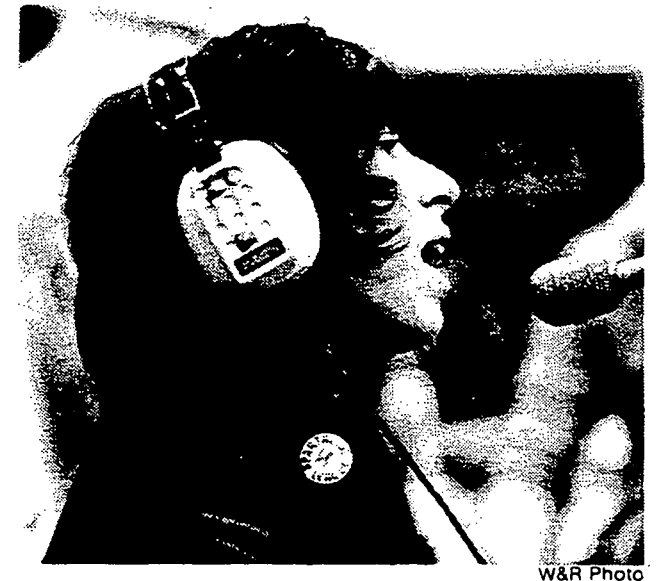
New York City, 4:00 a.m.: 10 phone lines of radio station WBAI are jammed.

So we went into the phone arena. And in the telephone workers union, the CWA, in Oakland there existed, at the same time as our feminist group, a caucus called the Militant Action Caucus which was politically supported by the Spartacist League. For about three years we fought out our feminist strategy and our nationalist strategy.... We fought