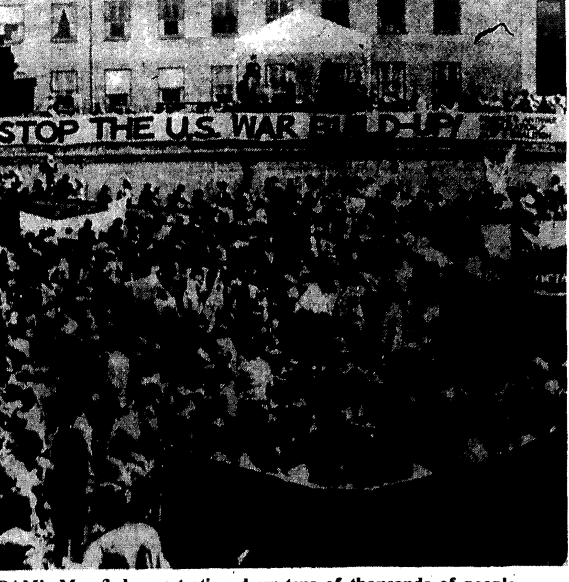
PAM's May 3 demonstration drew tens of thousands of people.

these efforts to squash dissent, WWP has now reorganized the entire national leadership structure for the upcoming "All Peoples Congress." A new "National Coordinating Board" has been created. This committee excludes all left organizations from any participation in discussion and decision-making over the character and direction of the "All Peoples Congress" and the "National Day of Resistance."