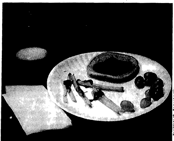
A balanced meal under Reaganomics: one ounce of meat, half a roll, six french fries, ketchup (a vegetable!), nine grapes, four ounces of milk.

cottage cheese, peanuts-either whole or in butter form-plus other nuts and seeds, could also be used in place of meat. Instead of bread. cakes, cookies and corn chips could be served; egg used in cake would be credited toward meat/meat substitutes; and juice used in making