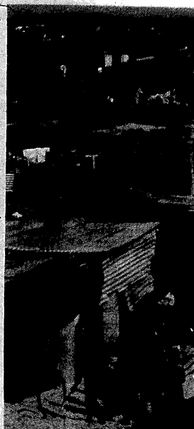
Crossroads, a Black settlement near

squatters. Once they set up a roadblock to prevent the camp occupants from getting food. Provisions ran low and fires, first kept alive with brushwood and then with tires, went out, leaving the squatters unprotected against the cold