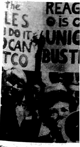
Support rally for air controller Cleveland, August 19.

The administration has assar organization itself just as individual members. It has reliate with PATCO since severthe strike began on August 3. urged several judges to impost PATCO that far exceed the unipay. And it got an administrat at the Federal Labor Relations recommend that PATCO be de is, stripped of its right to represent air controllers. This a