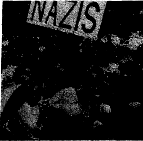
Detroit cops attack anti-Nazi demonstrators at August 22 rally.

AFTER the Nazis fled in their truck, the cops went on the rampage. They picked out individuals to attack and arrest. Several people were beaten by groups of cops after they were handcuffed. Many cops baited the crowd and tried to provoke fights.