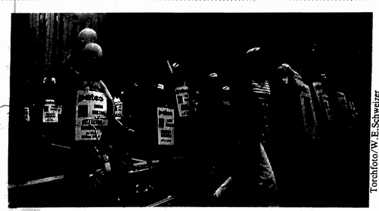
PATCO contingent in New York Labor Day march.

Although PATCO itself did not have the power to shut down the air system and defeat Reagan, there was no good reason why PATCO was left to fight the battle alone. Even the conservative British magazine the