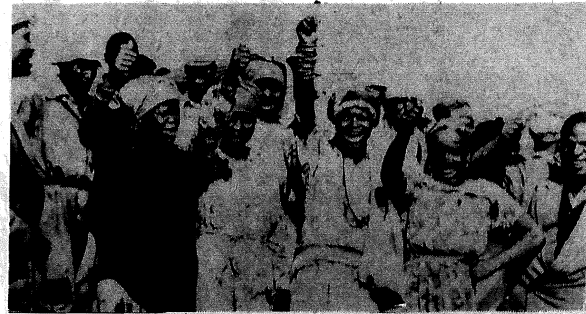
A South African woman at the BWOC conference spoke on the role of women in the struggle against apartheid. Above, a 1957 protest against

explained that the capitalist system itself is the fundamental cause of this three-way oppression. Other speakers spoke on labor organizing, the struggle for equality, better housing, as well as other issues. A South African woman spoke of the major role African women have played in the struggle against the racist apartheid regime. A brief