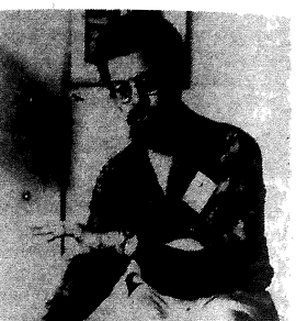
NBIPP leader Manning Marable.

Resolutions from the workshops touched on all kinds of questions facing Black people. Nearly all of them pointed to the grim situation