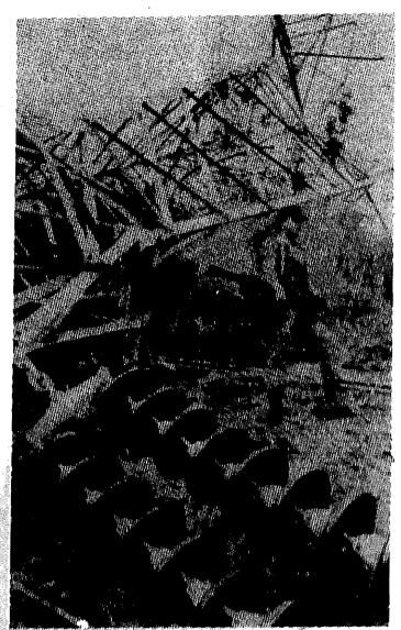
Government soldier stands guard over remains of electric power line tower toppled

tary equipment and more economic aid to shore up the Duarte government. At an August 28 news conference, Secretary of State Alexander Haig claimed additional aid was ne cessary only because the Russian and Cuban governments were step-