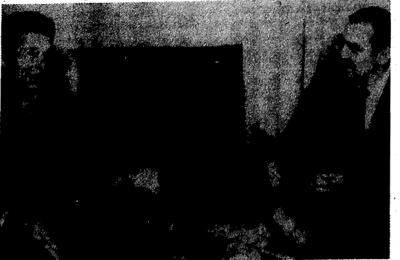
"All he [Reagan] knows about southern Africa is that he's on the side of the whites," a Reagan aide said last year. With him is South Africa Foreign Minister R.F. Botha.

In a public speech given in August, the same week as the invasion of Angola, Crocker said that U.S. policy was based on "three realities." One, "the U.S. has heavy economic interests in southern Africa." Two, Russia is trying to gain influence in the area. And three, southern Africa "must be understood on its own regional merits" and "it is not our task to choose between black and white." As the conservative British magazine The Economist commented.