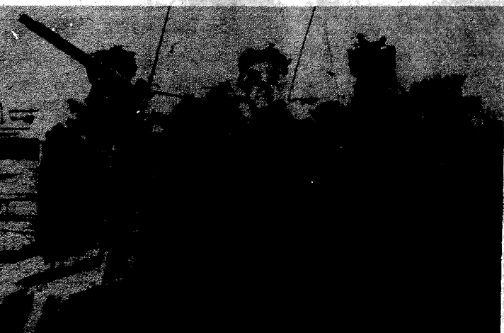
South African soldiers in Augola during invasion.