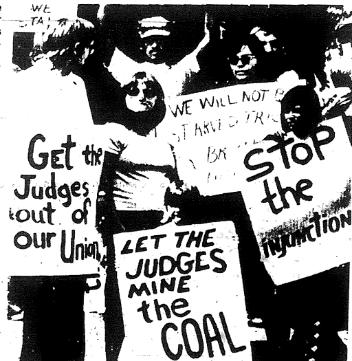
Coal miners and their families fight government's efforts to smash their struggle.

DECEMBER 15, 1977-JANUARY 14, 1978/TORCH/PAGE 3