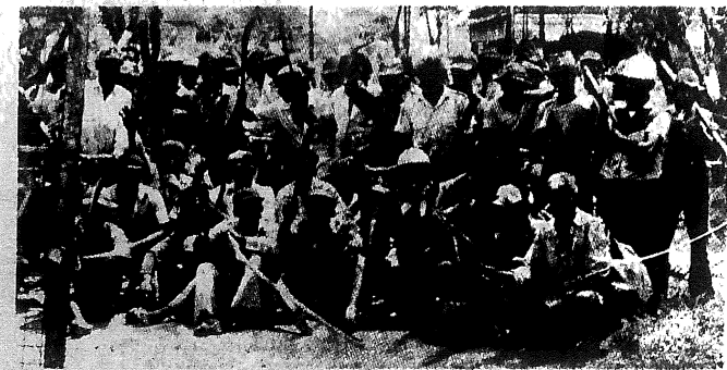
Striking Guyana sugar workers, ready for militant action.

The sugar workers of Guyana are waging a four-month-long strike which has become an all-out battle with the government. The workers— members of the Guyana Agricultural and General Workers' Union (GAWU)-have defied the government, the churches, the press, and