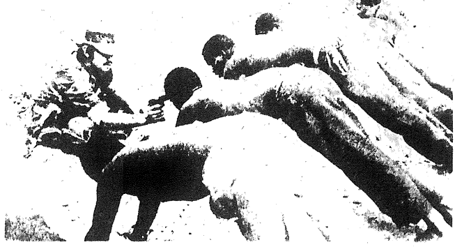
White soldier tortures unarmed Zimbabweans as part of racist government's war

work to expose the liberals who fall into line behind their calls for "peaceful reform" and "Majority Rule." SCAA is building a revolutionary movement against U.S. support to apartheid. The heart of this movement will be Black workers and youth. They will be joined by all workers, students, and youth who understand the need for workers' revolution. Together they will make up part of the revolutionary movement in this country. Join with SCAA to stop U.S. support to apart-