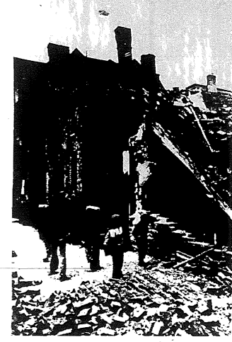
Detroit ghetto: millions live like this.

His foreign policy is going nowhere. Carter wants to convince the oppressed people of the world that the U.S. is the champion of human rights, peace and national liberation. To do this, he needs some diplomatic breakthroughs in the world's major trouble spots. He has to show that he can produce some settlements which appear