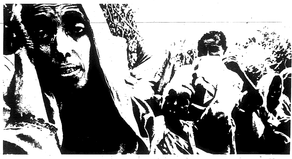
Ethiopians, near starvation, wait for aid at a refugee camp. The most oppressed people have nothing to lose but their chains. For the vast majority of the world's people, socialist revolution is the only way out of poverty and misery.

Because of this, the mos workers can most easily the divide-and-rule crap of ists and their labor hacks. capitalism doesn't have to stract theory for them. All t do is look at their own liv two and two together. The perience will teach them the talist system offers the wo ing but oppression and ru Most important, the most have a tremendous repres