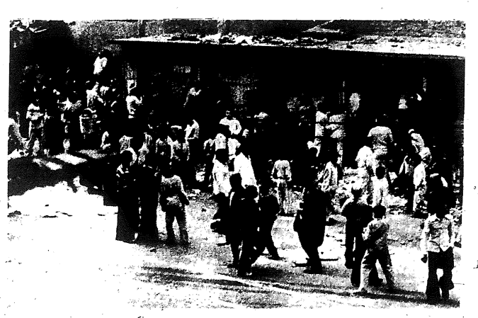
Cairo workers took to the streets last January when Sadat tried to raise prices

keep the people down. To defeat Zionism, the masses must To defeat Zionism, the masses must rely only on themselves. They must wage a struggle to destroy all the capitalist classes of the Middle East—Israeli and Arab. They must wage a struggle for socialism. Only a revolutionary movement led by the working class can unite the Arab people in a struggle to smash imperialism, Zionism and the sellout Arab regimes. This ism and the sellout Arab regimes. This strategy, the strategy of the Permanent Revolution, is the only road to liberation and real peace in the Middle