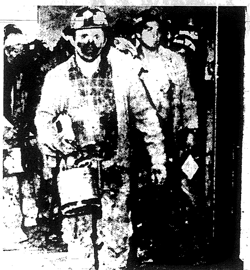
Coal miners begin strike December 5.

Thousands of miners in Ohio, West Virginia and Pennsylvania began walking off the job several days before the strike deadline. By December 6, 180,000 had stopped work, beginning what is expected to be a long battle for a new contract.