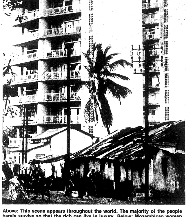
barely survive so that the rich can live in luxury. Below: Mozambican women train for national liberation struggle prior to FRELIMO victory.