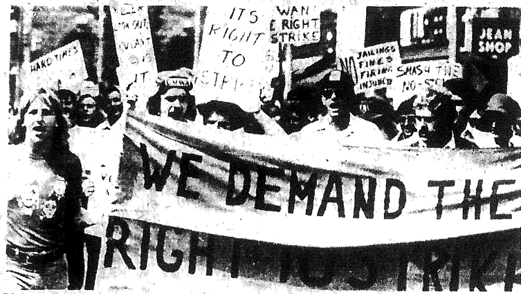
Right to strike is key issue in coal strike.

The key issue in the coal contract negotiations is the miners' right to strike. The strike is the miners' chief defense against the murderous conditions in the mines. The coal bosses and the union leadership want to take this weapon away from the rank-and-file of the UMW. This attack is aimed at the