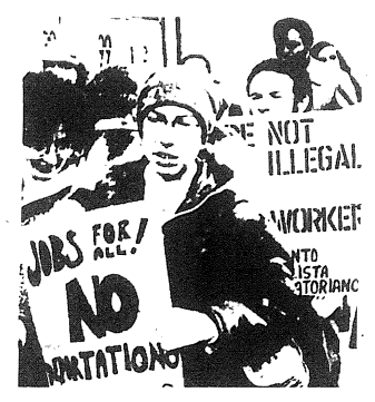
Congressman Mario Blaggi to fight for rights of undocumented