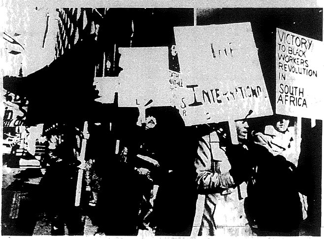
SCAA pickets for ed the Carson, Pirie, Scott Department Store in Chicago to stop selling the South African Krugerrand.

Blacks in South Africa must drive the imperialists completely out of the area. This means overthrowing the apartheid system which protects imperialist profits. Blacks must rule. The imperialists have no right to enslave them. But the only way the