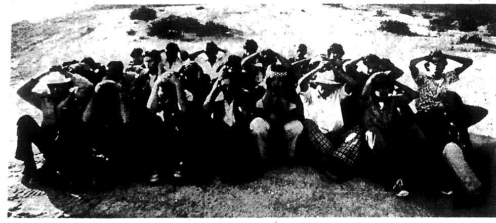
Mexican workers caught by U.S. Immigration agents about to get returned to Mexico. U.S. Imperialism plunders Mexico but refuses to let Mexican workers work and live in the U.S.

ialists." be swept aside if n are to win their uncompromising the ruling class t revolution can sion.