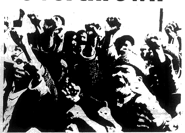
Declaration of war. Black youth give Black power salute at Stephen Biko's funeral.

Several days earlier, on November 30, the whites-(Continued on page 17)