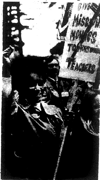
Leader of the Wisconsin NEA Black Caucus defiantly raises fist.

Finally, a vigorous campaign to show the farmers that the labor movement is the only force that can save them from the bankers and politicians is badly needed. Stop all foreclosures, nationalize the banks to provide cheap credit for farmers, nationalize industry to pay for education—these are the slogans that