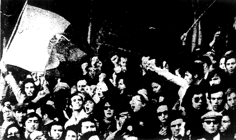
onstrate outside Lisbon jail. Workers forced release of political prisoners jailed by

Chile After the Coup Union Busting in Wisc Centrism in Crisis: I.S. of Britain