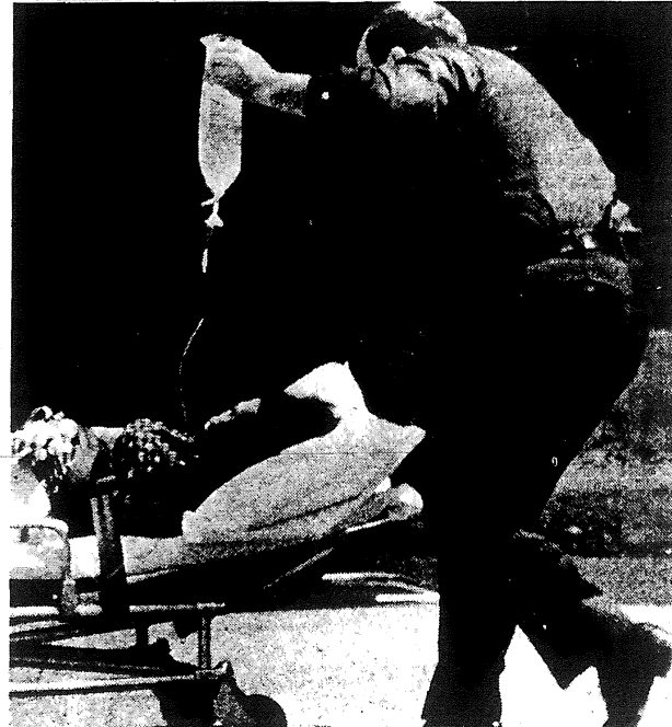
A victim of acid leak. Tragic industrial "accidents" are built into the capitalist system.

this sort are built into capitalist production. The ruling class captains of industry willfully cast aside safety precautions in demanding machines, factories, and other equipment designed for maximum efficiency and maximum profit.