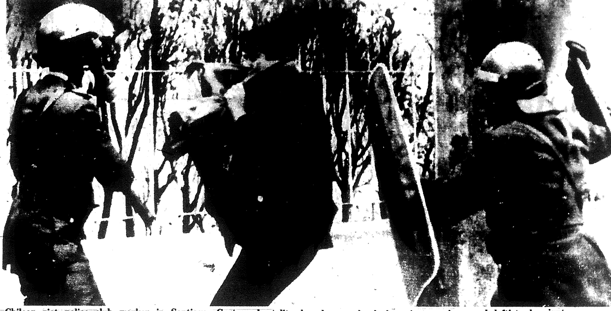
Chilean riot police club worker in Santiago. Gestapo brutality has been unleashed against workers and leftists by junta.

isaster from recurring on a world scale.