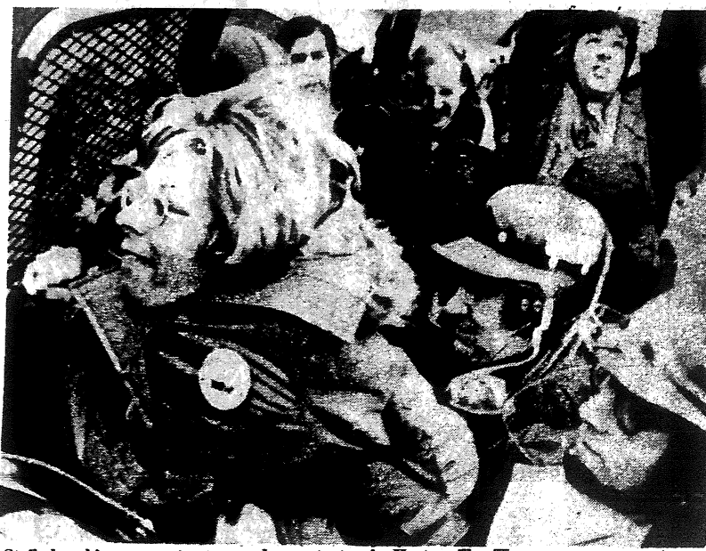
Strikebreaking cops strongarm demonstrator in Hortonville. The woman, a parent supporting the teachers, was arrested.