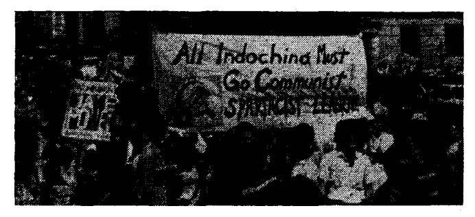
OUR SLOGAN Won Militants' Cheers.

The June conference in Cleveland of the Student Mobilization Committee, captive anti-war front group of