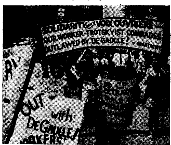
UNITED FRONT New York march on 22 June protests outlawing French revolutionary groups.

The PCF leaders, along with the CGT, their trade union arm, did everything in their power to derail the movement. They attempted to split the initial student-