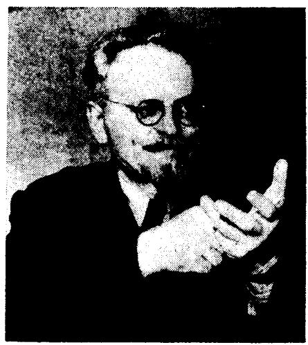
TROTSKY denouncing machine gun attack on him by Stalinist gangsters.

printed in the 3 December Newsletter and reprinted in the Bulletin. The document describes the SWP as "turning completely away from the working class." The dispute between the SLL and the SWP is "a fight between the working class and the servants of the class enemy." It states: "We tell the SWP: The days when you could address us as 'comrades' are long since gone. Your political actions have placed you outside the camp of Trotskyism and of the working class. . . . There can be not the slightest question of your telling us what we must do to reestablish our reputation with you." At the conclusion of the document appears the statement: "The issues raised in the Nov. 21st letter by Farrell Dobbs. Secretary of the Socialist Workers Party, about what happened at Cax-