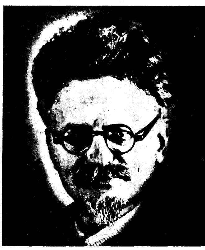
TROTSKY at Prinkipo in 1931.

(f) His shilly-shallying the centrist frequently covers up by reference to the danger of "sectarianism," by which he understands not abstract-propagandist passivity (of the Bordigist type) but an active concern for purity of principles, clarity of position, political consistency, organizational completeness.