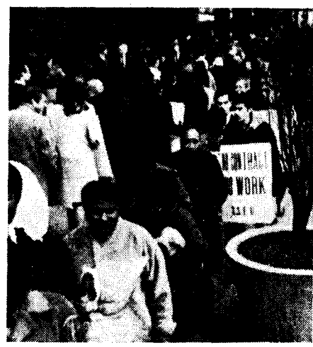
WELFARE RECIPIENTS support case worksrs' demonstration this Jan.

through an effective strike and win gains for staff, instead substituted a militant, but token, action by a handful of activists—a week-long "Live In" at the Department of Labor. This action, while no doubt embarrassing to the City, in no way compelled it to reverse a tactic fundamental to its projected "Destroy SSEU" strategy. Thus, while the SSEU now goes to court on the matter, staff remains divided during negotiations, and Local 371 implicitly encourages its members to scab in the event of an SSEU strike.