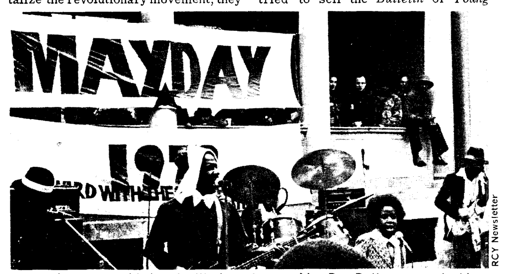
Entertainment provided at the Workers League May Day Rally was marked by its complete orientation to "youth" and absence of working-class content.

As in a Stalinist organization where political discussion either consists of reading the litany or is suppressed altogether, and embarrassing questions are simply characterized as "Trotskyite questions" and the asker is expelled, so it is in the WL/YS except that embarassing questions are characterized as "Spartacist Questions" and the asker is expelled. WL/YS supporters who have tried to sell the Bulletin or Young