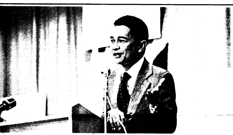
Filipino ex-Foreign Secretary Manglapus calls upon army to oust Marcos thus "liberating" Philippines. Does Maoist "bloc of four classes" include such people?

NEW YORK, 17 June—Members of the anti-Marcos wing of the Filipino bourgeoisie spoke here yesterday. Former Foreign Secretary and Senator Raul Manglapus and former Consul General in Los Angeles Roberto Mallo addressed an audience of approximately 100 on their recent defections to the United States and their program for Filipino "liberation."