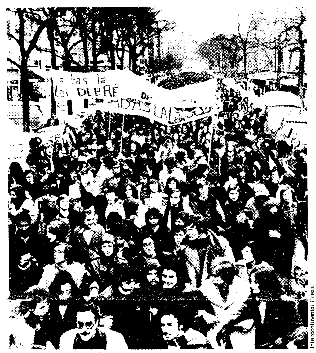
March against the Debré law which took place before the national demonstration on 22 March. National action turned out 300,000 in Paris and other cities.

The French student demonstrations that began in mid-March against new draft and educational laws have been an important element in the social upheavals following the French elections. Student unity with striking Renault workers produced a massive demonstration of over 100,000 in Paris and 200.000 in other parts of France. These demonstrations were followed one week later by additional actions and culminated in the 50,000-strong May Day march in driving rain.