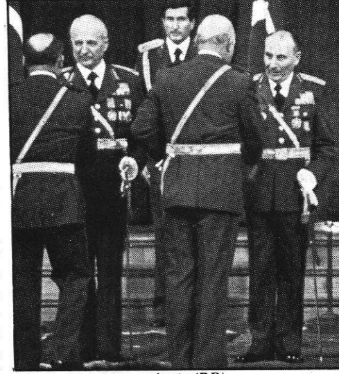
The Turkish military junta (DR)

The spread of political movements into the ranks of worker militants was essentially a development of the 1970s. But comparing the strength of the left political currents in general with the strength these currents had in the working class produces some interesting results.