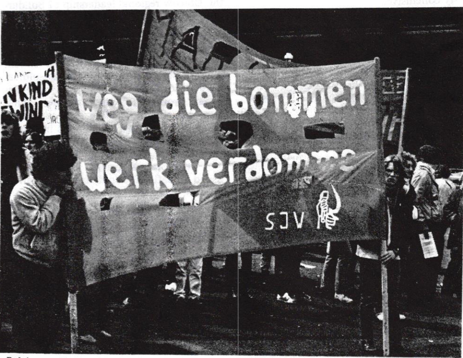
Belgian youth demand "No bombs, jobs damn it." (DR)

The day before the March, on April 23, in Antwerp 2,000 high-school youth struck for jobs and against the government's cutbacks in education. They marched to the drydocks in Hoboken and chanted, "Reopen Cockerill, jobs for all."