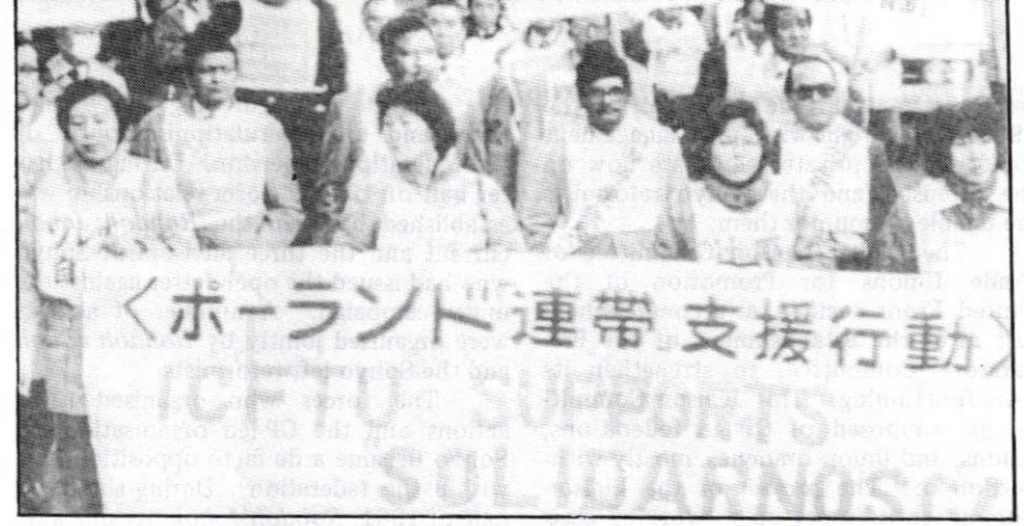
Japanese workers in solidarity with Solidarnosc (DR)

July 1981: At the congress of the chemical workers federation, 120 delegates out of 314 opposed the unity move. Most of this opposition came from the small to medium-sized factories. At the annual congress of the private railway and bus workers, union delegates from the medium-sized companies expressed their opposition. The Sohyo annual congress could not decide. The CP-led unions and federations were strongly opposed, knowing that they would be sacrificed immediately to this 'unity'. The SP-affiliated leaderships were split. Opposition to the