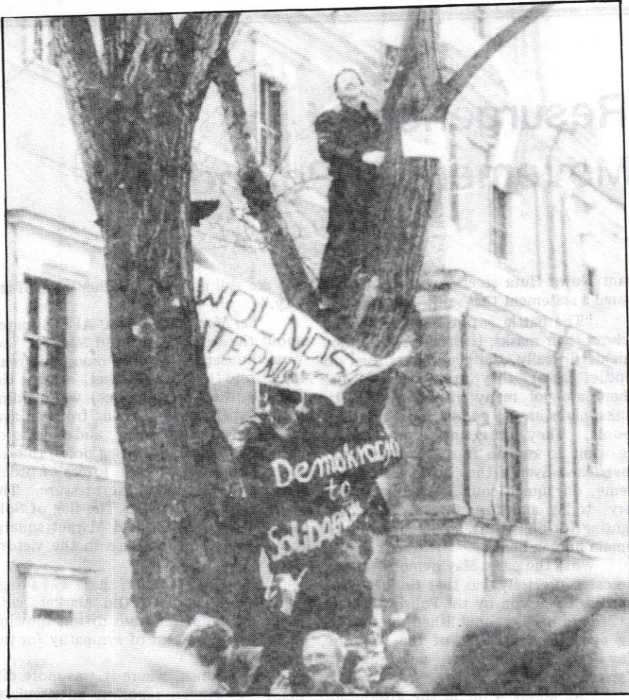
May Day slogans in Poland "Democracy, Solidarnosc"

"No appeal will prevent the youth who want to fight from doing that. If it is effective enough to deny them other means of fighting, it will throw them into the impasse of terrorism. No appeal can defuse the explosive combination of dispair and hatred that exists.