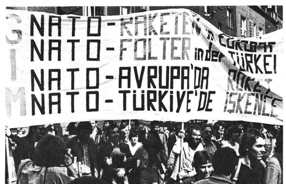
"NATO=Torture in Turkey," Turkish workers in Germany

Any reference to the existence of the Kurdish nation amounts to "separa-