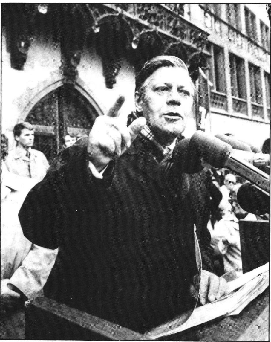
Schmidt-still in control

At the concluding rally, a giant balloon was launched by the Red Mole group, a youth organization close to the German section of the Fourth International. It pulled a huge banner that pointed to the next stage of the movement. The banner said: "See You Again on June 10 in Bonn."