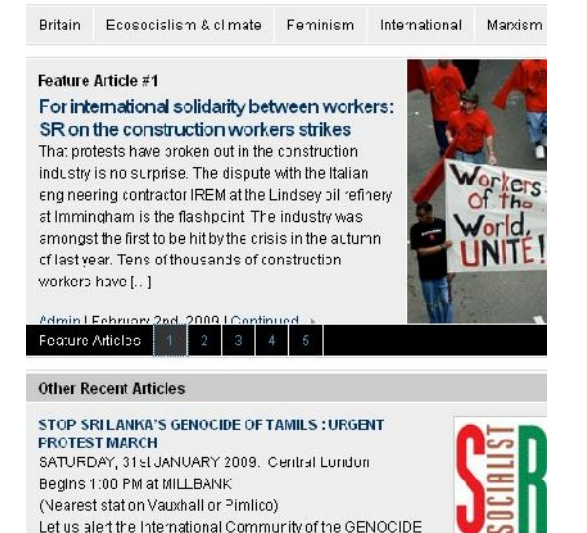
Resistance recently relaunched its website

That protests have broken out in the construction industry is no surprise. The dispute with the Italian engineering contractor IREM at the Lindsey oil refinery at Immingham is the flashpoint. The industry was amongst the first to be hit by the crisis in the autumn of last year. Tens of thousands of construction workers have been thrown out of work. In recent years the industry has been deregulated, privatised and largely de-unionised. There has been cutthroat competition amongst construction employers for ever-lower wages in order to get and deliver contracts. No wonder resentment builds up.