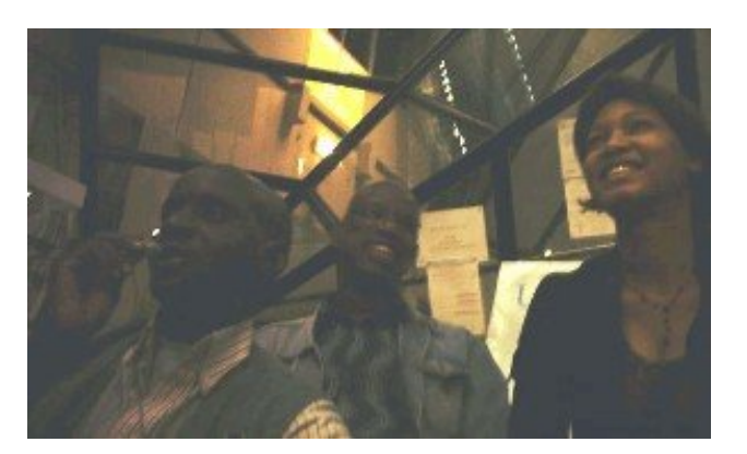
World Social Forum attendees.

At the initiative of the PSOL (Brazil) and the NPA (New Anticapitalist Party, France) a conference of the international anticapitalist left took place during the World Social Forum with representatives from 20 countries and around twenty organisations.