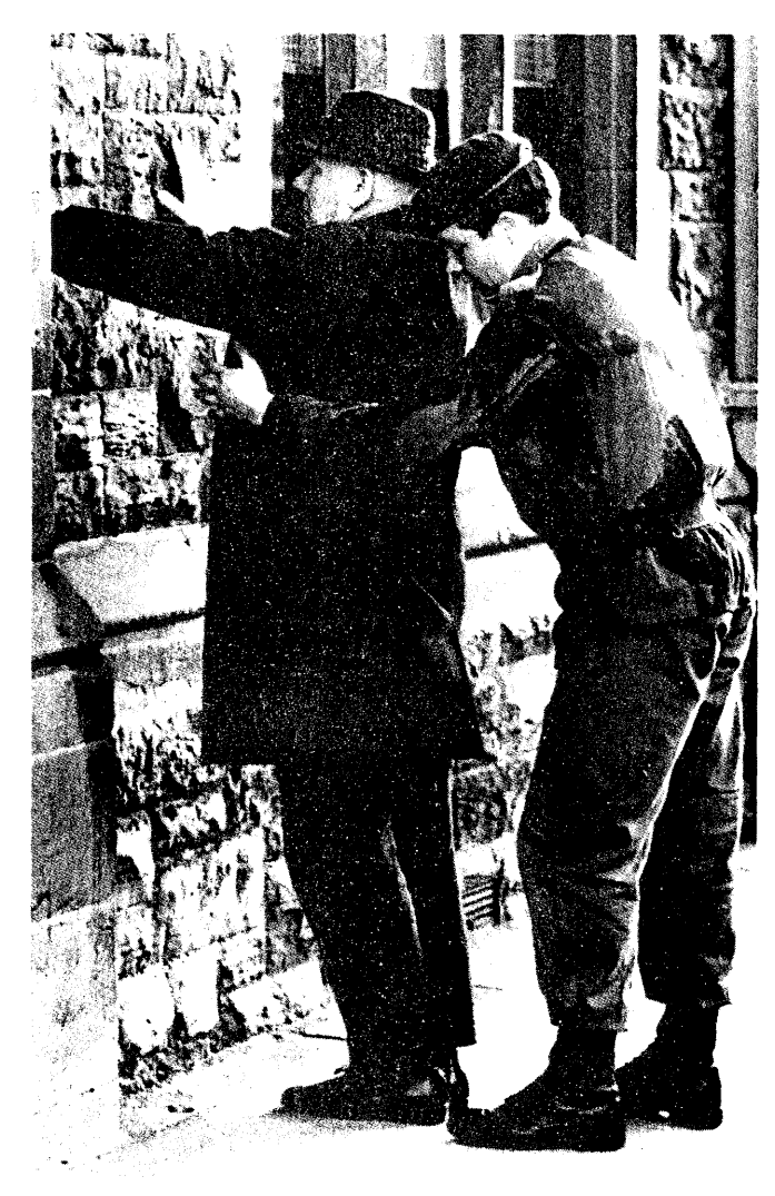
British soldier searches Belfast citizen

the perspective of proletarian revolution and the consequent necessity of an integrated vanguard party.