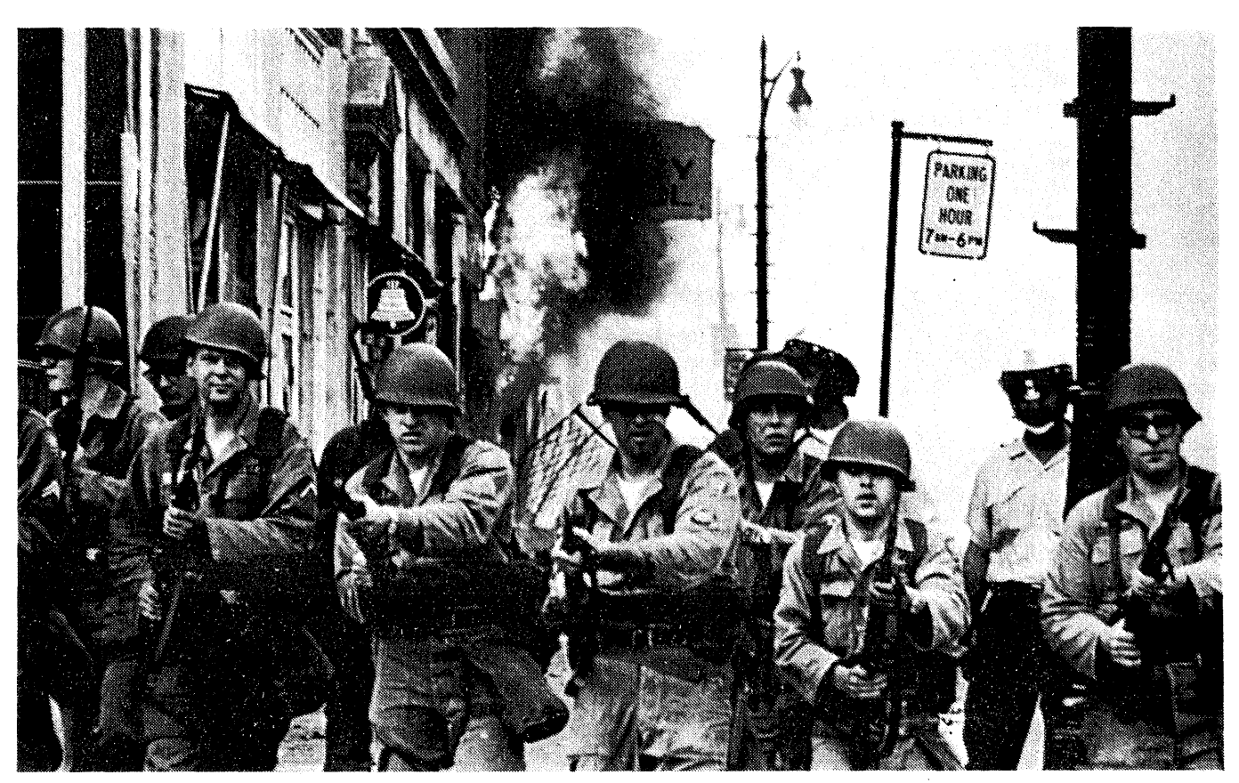
Bayonets fixed, National Guard attacks blacks, Detroit 1967

and disorient a revolutionary party. An organization cohered by diplomacy, lowest-common-denominator consensus and the concomitant programmatic ambiguity (instead of principled programmatic agreement and the struggle for political clarity) awaits only the first serious test posed by the class struggle to break apart. Conversely, organizations in which the expression of differences is proscribed--whether formally or informally--are destined to ossify into rigid, hierarchical and lifeless sects increasingly divorced from the living workers movement and unable to reproduce the cadres necessary to carry out the tasks of a revolutionary vanguard.