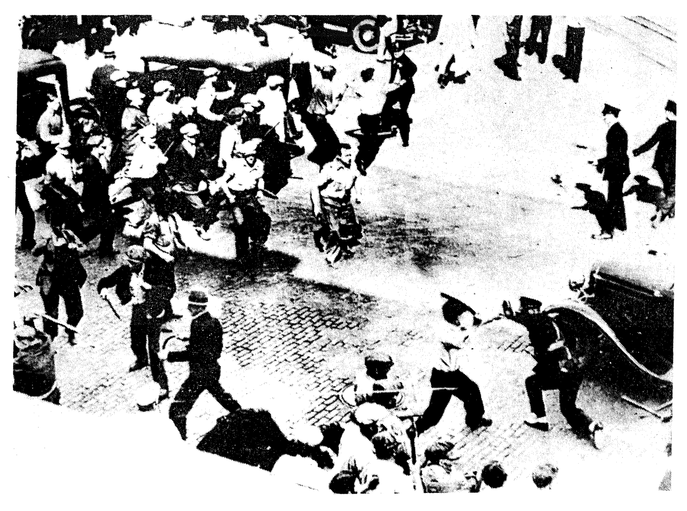
Striking truck drivers, led by Trotskyists, disperse cops: Minneapolis, May 1934

the case of other democratic rights, this is not some sort of categorical imperative. We would not, for example, favor the emigration of any individual who would pose a threat to the military security of the degenerated or deformed worker states. The right of individual immigration, if exercised on a sufficiently wide scale, can come into conflict with the right of self-determination for a small nation. Therefore Trotskyists do not raise the call for "open borders" as a general programmatic demand. In Palestine during the 1930's and 1940's, for example, the massive influx of Zionist immigration laid the basis for the forcible expulsion of the Palestinian people from their own land. We do not recognize the "right" of unlimited Han migration to Tibet, nor of French citizens to move to New Caledonia.