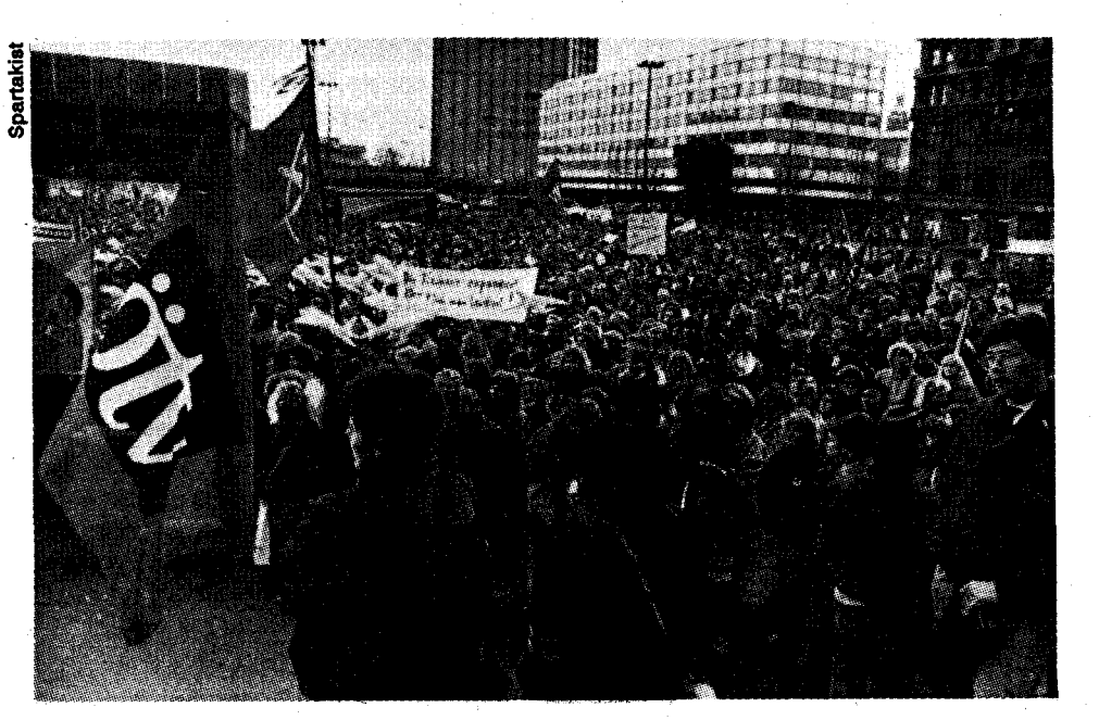
Demonstration in Leipzig, February 27, against mass unemployment. The black-red-gold German flags have been replaced by trade-union banners. For workers resistance against the Fourth Reich!

The Spartakist Workers Party of Germany (SpAD), section of the International Communist League (Fourth Internationalist), was the one and only party which said "no!" to capitalist reunification. The SED/PDS and its satellites (such as the United Left and KPD) said "jein" (yes and no) to Anschluss (annexation), selling out the gains of the DDR which had been built up by the workers. Stalin's thug Ulbricht and his successor Honecker pretended they could build "socialism in half a country" if only you surrounded it with a high enough wall and controlled it with a big