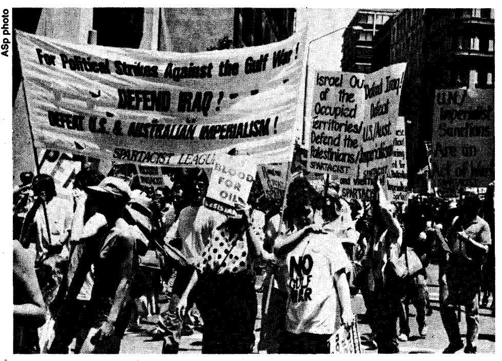
Spartacist contingent in Sydney anti-war march. Fighting for an antiimperialist program based on the massive social power of the working class.

Through February and March we ran well-attended weekly public classes. Many of those attending had come into contact with reformist organisations who fell in line as the "best builders" of the popular front "anti-war" protests, like the International Socialist Organisation and the Militant group. Looking for a revolutionary alternative, they sought us out to learn more about our unique analysis of the Gulf War, the Hawke government and the tumultuous changes in the USSR and Eastern Europe. Forums in Sydney and Melbourne and on campuses on the topic "'New World Order' Means Imperialist Slaughter!" were also well attended. We were able to sell subscriptions by pointing to the record of the pro-imperialist "pacifists" like Tom Uren, who argued throughout the war for sanctions to starve the people of Iraq into submission. The pro-imperialist