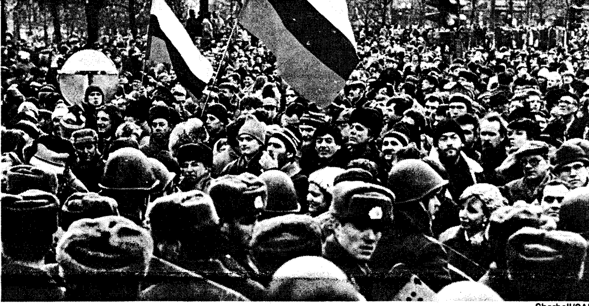
Outrage over drastic price rises (left). Pro-Western "democrats" stage rally in Moscow.