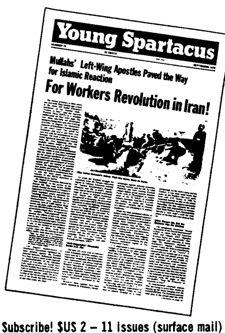
Order from/pay to: Spartacus Youth Publishing Co, Box 825, Canal Station, New York, NY 10013.

In the latest Young Spartacus no 75, September 1979. Monthly newspaper of the Spartacus Youth League, youth section of the Spartacist League/US.