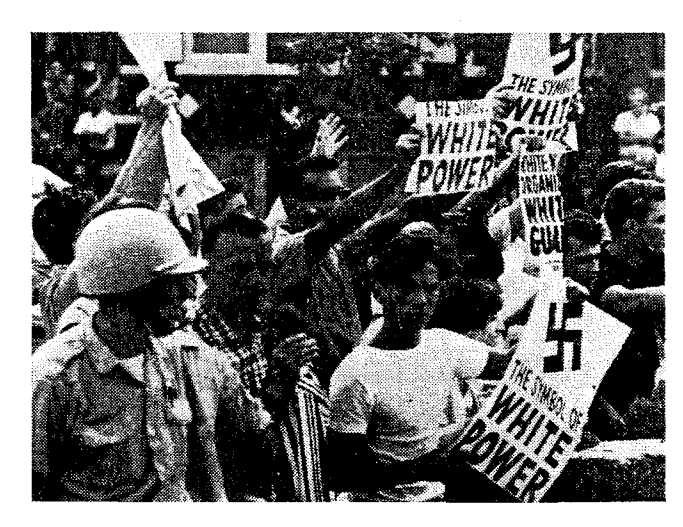
Racists in Chicago attack civil rights march.

For the last three summers ghettoes across the country have been rocked by elemental, spontaneous,