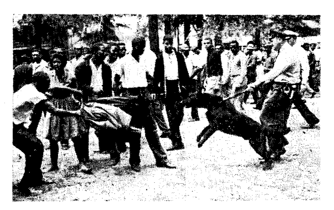
Cops harass 1963 Birmingham demonstrators.

people were disenfranchised, stripped of all legal rights, and permanently denied access to adequate education. Those setbacks were codified into a series of laws institutionalizing the rigid segregation which has been the dominant feature of the South ever since. It was the racism launched during this period which has since kept wages in the South at approximately half those of the rest of the country (and the wages of Negroes at half those of whites in the country as a whole), prevented effective union organization and perpetuated a crushing poverty on the land for black and white alike, though