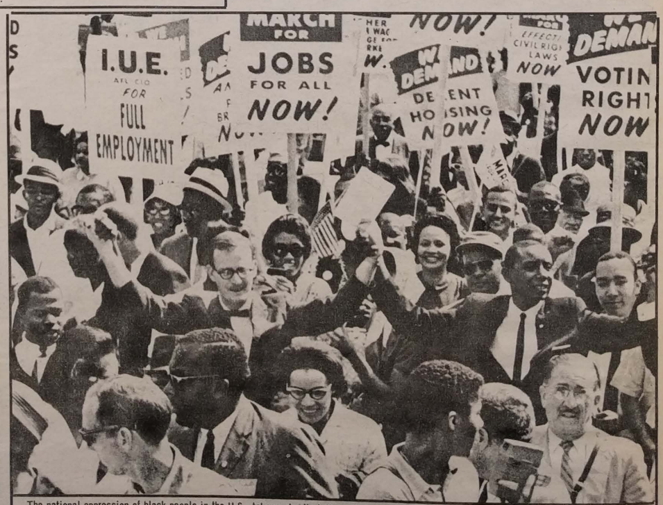
The national oppression of black people in the U.S. takes a deadly toll on the whole U.S. working class. With the worst unemployment, one quarter of the olack sector of the labor force has no chance of finding work! The effects of this oppression by the bourgeoisie is a cheap labor supply that thus forces down wages and lowers the material conditions of the whole working class, thus it is absolutely neccessary for the U.S. working class to support the democratic rights of all oppressed nationalities, and to support the democratic right of port this struggle, not out of any abstract sentiment, but as the pre-condition for its own social emancipation!

But in describing the relationship of the Black Nation and the black oppressed nationality in the United States as a whole, it is critical to see how the nation came into being in the first place, and how this initial appearance set a particular pattern for this relationship that still exists. At the end of the Revolutionary War, the movement fully into United States society was anticipated, but the introduction of capitalist slavery in the early 19th century, spurred by the emergence of cotton as an international cash crop able to be supplied by the United States South with the cotton gin and slave labor turned the gradual dying away of sla— But in describing the relationship of the