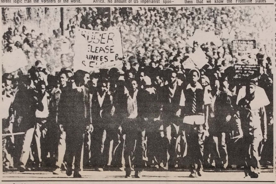
Countries want independence, nations want liberation, and the people want revolution — this is the main and irresistible trend in the world today! The racist colonial regime in South Africa has done so much harm to the people of Azania that they will surely not allow the murderers of Steven Biko go unpunished! The masses of Azania and the oppressed peoples of the U.S. must close ranks against imperialism and social imperialism; they will never put down the butcher knife voluntarily, revolution is the solution.

Q. Some of PAC's detractors have labelled you as racialist and anti-communist. Where does PAC stand ideologically? A. Well, that is the malicious slander of those who are afraid of us because of our correct political line. Between the capitalist road and the socialist road, PAC has taken the correct scientific socialist road based on Marxist-Leninist philoso—(cont. on p.5)