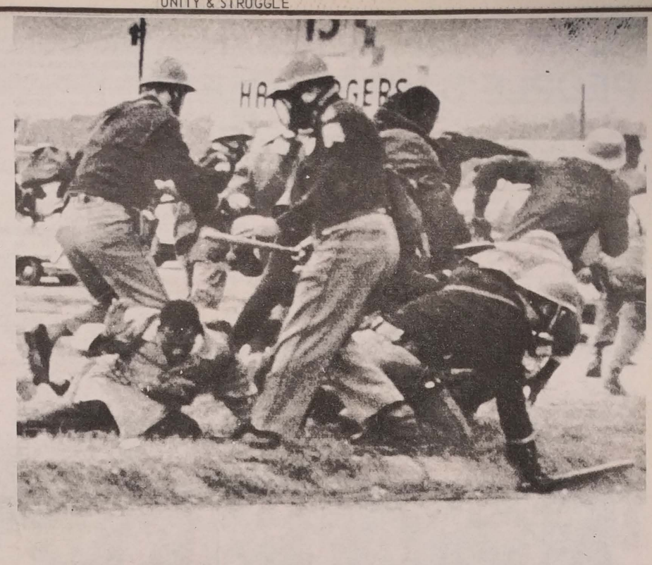
Discrimination and segregation are the pincers of national oppression caused by monopoly capitalism. They cannot really be destroyed until monopoly capitalism is destroyed! Only violence, armed struggle, can change capitalist society to socialist society. Not "turn the other cheek," or "non-violent revolution", or "we shall overcome" by kneeling and praying as the police and dogs attack, and the racists shoot you down. Malcolm X's line of self determination self respect and self defense summed up the black working people's feelings in opposition to the black bourgeoisie's submissiveness and exploitation and oppression by capitalist and racist U.S. society.

active relationship with the Abolitionists made