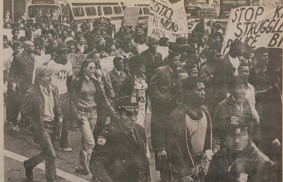
The imperialist economic crisis worsens & the bourgeoisie increasingly reduces the economic conditions of the people and cuts away at basic rights, attempting to divide the people. The mass revolutionary struggle must close the ranks of the people vs the enemy.

orchestrated by the bourgeoisie to take us as far away from revolutionary ferment as we can get. The only reason those 16 have to be admitted in a special way into the medical school is because of continuous discrimination. Some opportunists have exposed themselves on this question, like the so-called friends of black people who have shown themselves to be straight out racists, for instance, the American Jewish Committee. And the black lackies like Bayard Rustin, who tells blacks that they should not resist this erosion of reforms because they are not as important as unemployment also reveal the extent of the perversion they are warped by. If we stop and think, we know that 16 minorities out of a population of 200 million is not going to make change, and that just to have this program is a pure example of to-kenism and nothing else. It is really the bourgeoisie struggling among themselves, because the masses are not struggling to get into the Univ. of California Medical School. But this attack the Bakke case makes is important because it is aimed at creating a more conservative and right wing climate in the US, and the various organizations that were supposedly interested in Negro civil rights, are coming up on the wrong side of the question. This is good, and important that many of the so-called liberais are being exposed on this issue, because all this