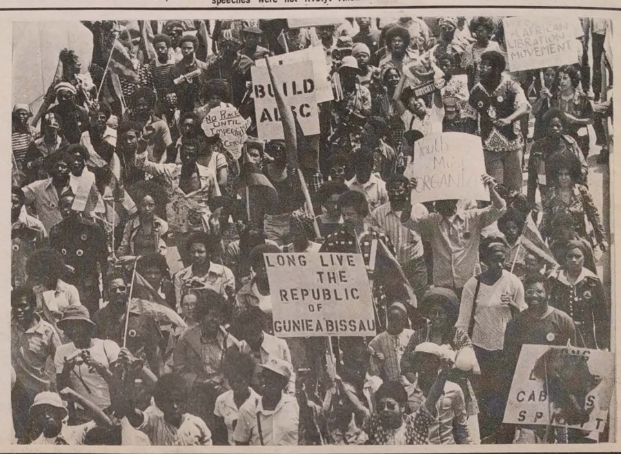
The experience of the people in the African Liberation Support Committee confirms what V.I. Lenin pointed out, i.e., that it is impossible to struggle against imperialism without a long and determined struggle against opportunism. Imperialism and opportunism have been shaking hands in ALSC for several years now, by sabotaging an effective anti-imperialist mass organization that once mobilized tens of thousands of black people in opposition to imperialism and colonialism in Southern Africa. The struggle continues!

The League for Proletarian Revolution's appearance at the International Conference, while positive in some ways, was marred by their lack of firmness, almost (cont. on p.5)