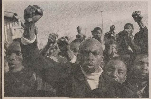
The just struggles of the people of all countries support each other.

South Africa is in political turmoil because of the recent rise of rebellions of the heroic Azanian people and the reactionary crackdown and fascist repression against the masses in South Africa by the racist colonial Vorster regime. U.S. imperialism's apologists would like for people to believe that the Vorster regime people to believe that the Vorster regime will have a change of heart and lay down the butcher knives of white colonialism, that somehow UN resolutions will make Vorster the murdere & robber change into a man of peace and virtue, They say it you could just talk sense to Vorster, everything would be alright. So they advocate more "talks" with the racist South African regime. But what we must understand very clearly despite all the lies of the hourclearly, despite all the lies of the bour-geois press--is that Vorster's regime is following a very clear logic! It is a vicious logic that Chairman Mao