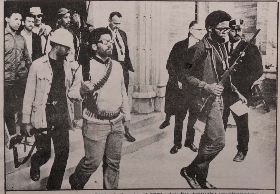
The "peaceful transition to socialism," dished up by the revisionist CPUSA and the black bourgeoisie's non-violent revolution are related reformist lines, but the question of violence vs non-violence became a mass question in the U.S. for the black liberation movement and the answer of the masses rung out from the rebellions in the 60's, only armed struggle can break to back of national oppression, and these students at Cornell Univ. used armed self defense in their struggle against the forces of racism in 1968.

ually began to produce more than the South could use did the struggle for political power intensity. For one thing, once the North began to produce corn and meat for export, two products that had once been solely traded to the South, and also when the North became principally an "industrial country," then the North no longer depended on the South as it had earlier. Prior to this, the only products the United States exported were cotton and tobacco, the products produced by slave labor. (See Engels—Poverty of Philosophy, Introduction). These facts made slavery more expendable, plus the fact that the American cotton monopoly now had to face powerful competition in India, Brazil, Egypt... The gradual depletion of cotton lands, the increased prices of the slaves and consolidation of the Northern industrial economy forced. (cont on p.5) economy forced (cont on p.5)