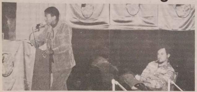
The October League's National Fightback Conference was held in Chicago, December 27-28th, which brought together over 1500 workers and unemployyed committees from around the country. The purpose of the National Fightback Conference was to organize a national Fightback Organization in mass struggle against unemployment, the layoffs, budget cuts, in health, welfare, housing etc.

On December 27-28, 1975, the October League held their first national Fight Back Conference in Chicago, Ill for the purpose of uniting the many local Fight Back workers and unemployed committees which they had been organizing around the country into a mass national Fight Back organization The Congress of Afrikan People par-ticipated and endorsed the Conference which registered approximately 1,300 people, despite the fact that there was a glaring absence of other anti-revisionist formations.