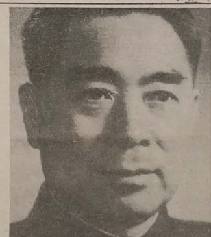
carrying out of Chairman Mao Tse Tungs revolutionary political line in China and internationally, and for the victory of the cause of the Chinese peoples liberation and the cause of com-(Continued on page 2)

First we wish to express deep and revolutionary sympathy to the almost 900 million people of the Peoples Republic of China on the death of one of their ablest revolutionary leaders Premier Chou En Lai. But also revolutionaries and progressive people the world over mourn the passing of this great communist leader, a loyal revolutionary fighter of the Chinese people and an outstanding, long tested leader of the Party and the state. And although the bourgeois American press tries to imply that somehow Chou En Lai was a moderating force in the practical policies of the Communist Party of China and the Peoples Republic of China, in actuality, Comrade Chou En Lai fought heroically and with utter devotion for the implementation the