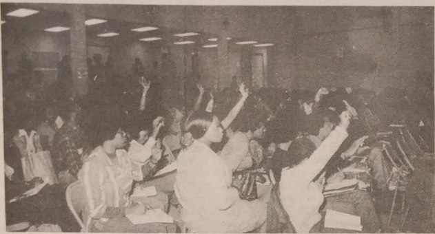
Held its 2nd National Assembly meeting October 25th, in Atlanta, where over 200 women and men discussed the principles of unity of the BWUF - anti-racism, anti-capitalism and anti-imperialism, and saw the adoption of national programs such as sponsoring of a multi-national Women's Conference March 6th, in New York City to discuss the formation of a Revolutionary Multi-National Women's Front.

October 25, Saturday the Black Women's United Front (BWUF) held its 2nd National Assembly meeting with a representation of 205 people. The main purpose of the meeting was