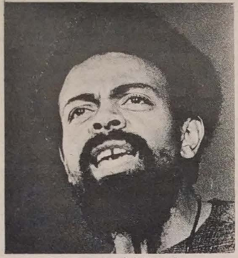
Imamu Amiri Baraka

"The success of the revolution depends on the combined efforts of everyone such that no one can be omitted, and thus the traditional rather 'passive' role of women must be changed so that their abilities are used to the full"