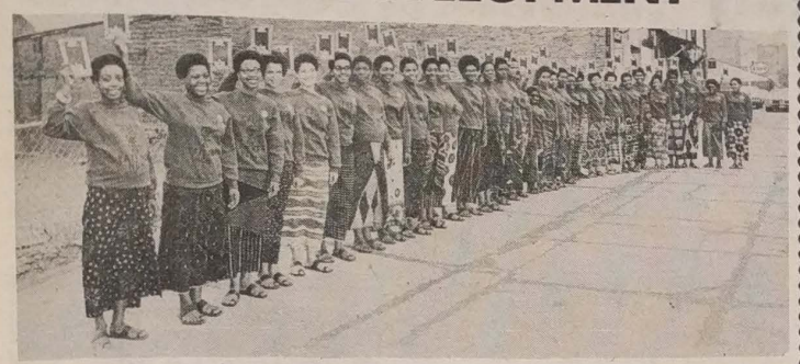
The Malaikas of the Committee For Unified NewArk.