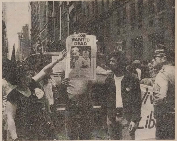
"There is no difference between Black and Puerto Rican people's struggle for National Liberation. The struggle is the same."

Independence Parties The committee recently agreed to