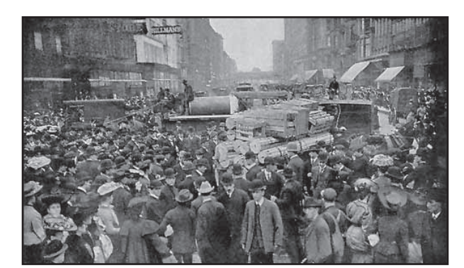
A blockade formed by union teamsters

Striking linemen, in sympathy with the Teamsters, cut all wires to the packers' North Side order departments and distribution depots. At Van Buren and State, volleys of rotten fruit and eggs were hurled at the scab procession and the cops. At Monroe and State, 20 wagons blocked the way as thousands of strike supporters controlled the streets in the center of the city.