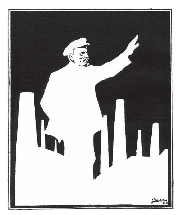
Drawing of Lenin Addressing workers above the factory chimneys

them not to rock the boat; otherwise it will decrease the bosses' ability to compete.