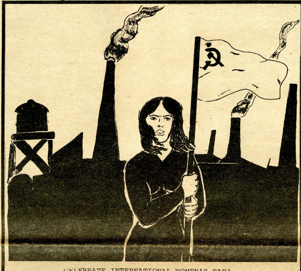
CELEBRATE INTERNATIONAL WOMEN'S DAY!

For broad masses of women to win liberation they must actively take part in social revolution. The ultimate victory of proletarian revolution must include the full participation of the broad masses of women, particularly working women. Engels pointed out in The Origin of the Family, Private Property and the State: "The first class antagonism which appears in history coincides with the development of the antagonism between man and woman ... and the first class oppression with that of the female sex by male." The change in social status between man and women gradually took place with the breaking up of primitive society and the emergence of private ownership and the appearance of classes. Oppression of women is first of all class oppression, and since the oppression of women has its roots in private property and class exploitation, a complete change in the unequal status of women can only be achieved through revolution- through the elimination of private property and exploiting classes. Our "Resoluion of the Woman Question" states: "The emancipation of women is a world historic task of proletarian revolution. The full emancipation of women can take place only under the dictatorship of the proletariat where it will be possible to abolish private property through socialist ownership of the