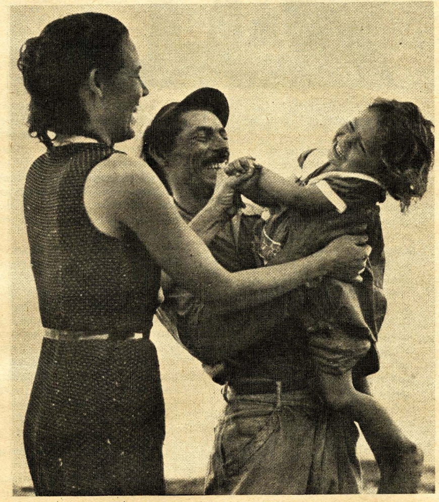
MAKE OUR PROLETARIAN FAMILIES UNITS OF REVOLUTIONARY STRUGGLE!

tween parents and children. We didn't start off being clear on the political line that could guide our work. And we have vacillated on how much organizational responsibility was correct and even realistic in this pre-party period. But we did realize that organizational discussion and decisions about