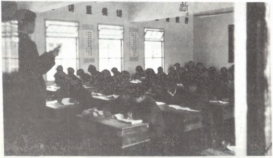
Workers' colleges like this are commonplace throughout socialist China

"The Ninth Congress of the trade unions was held in 1978 when the main task facing China had become to turn the country into a modernised and democratic socialist one. This will benefit the whole Chinese people and so it is also a central question for the trade union movement. Based on this perspective the ACFTU currently has five major tasks: