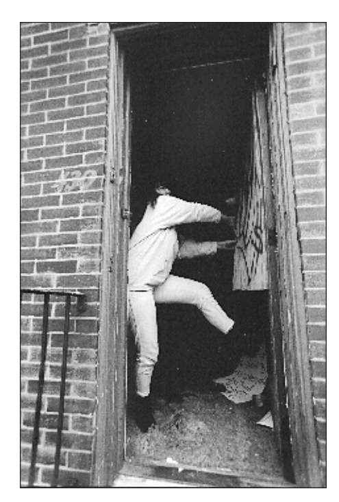
This woman participated in taking over empty homes in Philadelphia to house homeless families. There is a new movement developing to distribute what is produced by society to people whether they can pay for it or not.

the process of social revolution: the new classes forcing their way into and disrupting the established class relationships, forcing the reorganization of society. The new classes were totally outside of the relationship between the existing classes. Therefore, there was no social contract between the nobility on the one hand and the bourgeoisie and workers on the other. A new social relationship could be finally settled only by force.