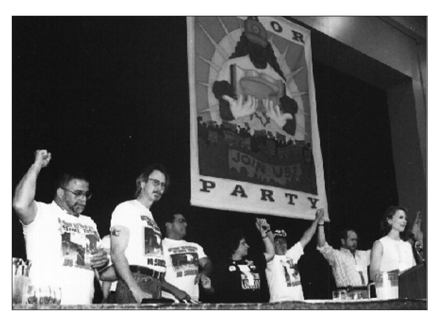
Detroit newspaper strikers address the founding convention of the Labor Party in June, 1996. The economic revolution has torn apart the social contract between the worker and the capitalist.