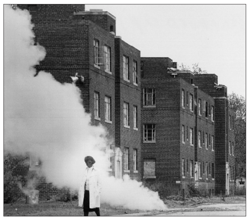
Parkside Housing Project in Detroit stood empty and heated as massive welfare cuts forced people into the streets. The important thing is to understand what lies behind the millions of homeless, acres of burned-out neighborhoods and the slaughter of our youth.

As the application of these new scientific marvels to production expanded, a new economic category, the structurally unemployed, was created. A hundred and fifty years ago, the philosophers and scientists Karl Marx and Frederick Engels coined the term "the reserve army of the unemployed." This was the industrial reserve to be thrown into the battle for production as the need arose. The structurally unemployed are different. They are a new, growing, permanently unemployed sector created by the new emerging economic structure. Once a job is taken over by robotics, the worker who once performed that job becomes permanently unemployed. His category of work , his job, is eliminated because no human being can work as efficiently or as cheaply as a robot.