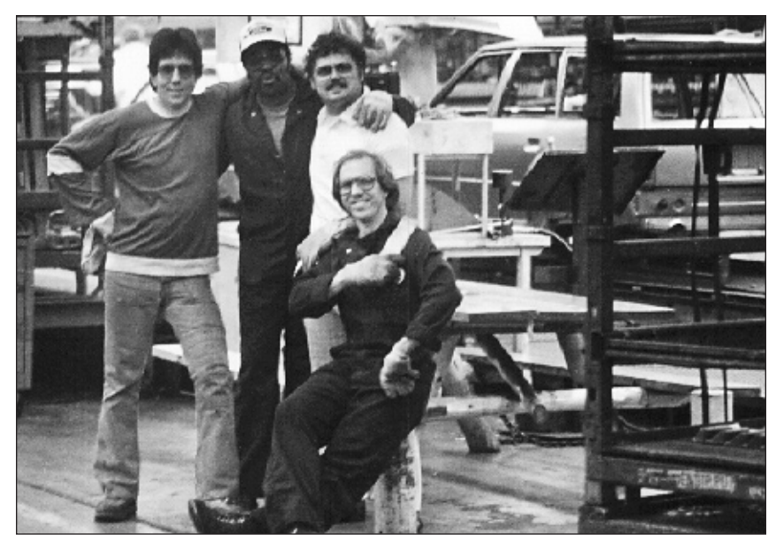
Ford assembly plant in Wixom, Michigan in 1982. Industrial production has been replaced by electronic production. Millions of people have lost their jobs and are unable to buy the necessaries of life. This process is throwing all of society and class relations into upheaval.

The contradictory relationship between the material forces of production and the productive relations forms and develops capitalism. That "certain stage" in the contradictory relationship begins with the "quantitative alteration of the body concerned" through the introduction of a