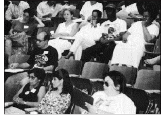
League school in Los Angeles

The purpose of our political education has been determined by the tasks history has handed to all of us. We have entered an epoch of social revolution brought on by the revolutionary changes in