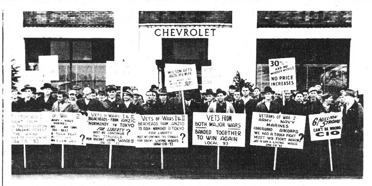
These pickets of Local 93 UAW in Kansas City were typical of those across the country.

This can be seen in the red-baiting work of the Association of Catholic Trade Unionists and the work of the reactionary Father Rice, who lobbied opinion in