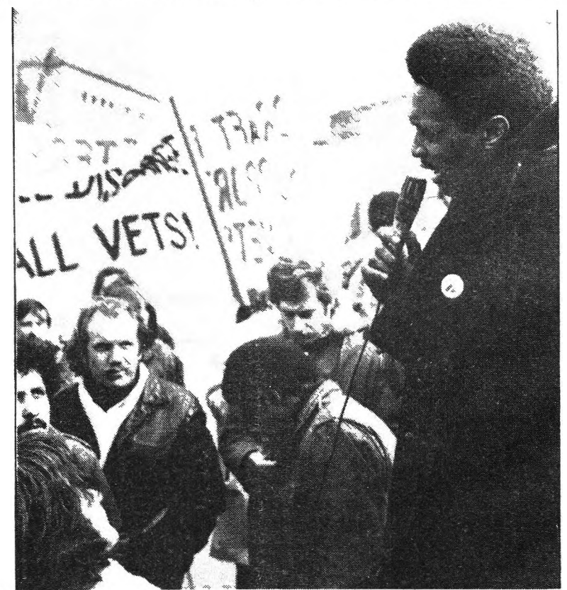
Veterans are a very important sector of the anti-draft, anti-war movement Here a Vietnam veteran tells anti-war demonstrators of oppressive conditions faced

thus has to be raised And it is a matter of correctly fighting for the interests of the working and oppressed people today (opposing the registration and the draft), without sacrificing the propaganda and agitation for the long term goal the dicta torship of the proletariat and socialism We have to make the struggle against the draft