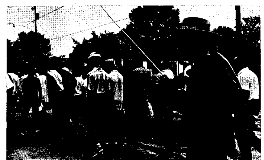
Communication system is part of Deacons' gear. During marches, walkie-talkies were used to report any incidents to organization's far-flung patrols. As demonstrations passed through white area, some Deacons mingled with crowd, others waited in cars.

The Deacons for Defense signify a major development within our struggle. For the first time since 1958 black working class leadership expounding and practicing self-defense has emerged. With even 15,000 members the Deacons are definitely a force to be dealt with. Self-defense changes the whole character of our movement and allows other questions to be raised. Self-defense intoduces the concept of a black liberation army for protection and survival. This in return raises the question for every black man in America : "Should I join or support charlies' army or the black liberation army (Deacons)?" This is the historical question of the hour. For our people to understand this question, our movement must become anti-imperialist-anti-U.S. racist government. Therefore, the next step in our struggle is to develop a black anti-imperialist movement. These questions were dealt with during the May 1st and October 30th Conferences. Since both conferences, we have consolidated and developed many of our objectives. In order to intensify the quality of our ranks REVOLUTIONARY NATIONALIST feels it necessary to discuss para-military warfare, Robert Williams' concept of urban guerrilla warfare, etc, We feel that these articles may help in the next step and the road ahead.