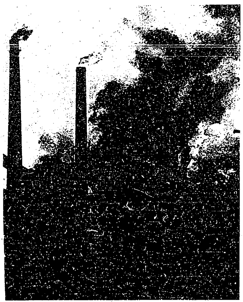
NEWS & LETTERS BOX 5463 GRAND CENTRAL STATION NEW YORK, N.Y. 10017