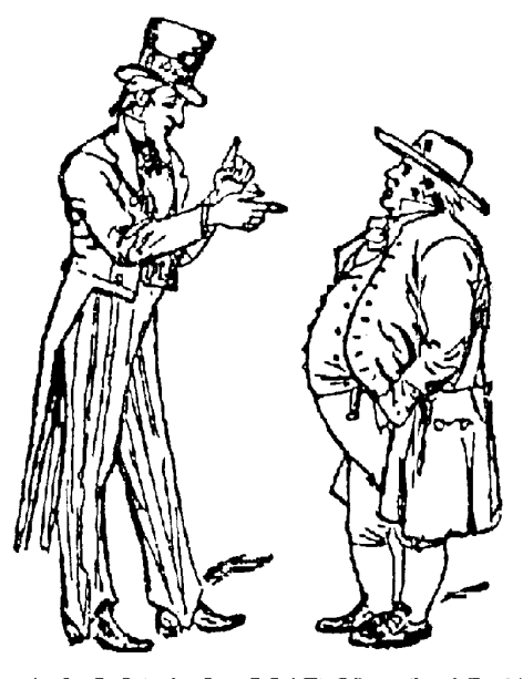
UNCLE SAM & BROTHER JONATHAN