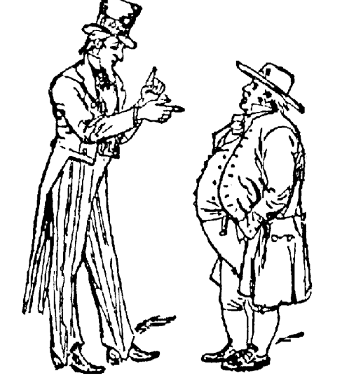
UNCLE SAM & BROTHER JONATHAN