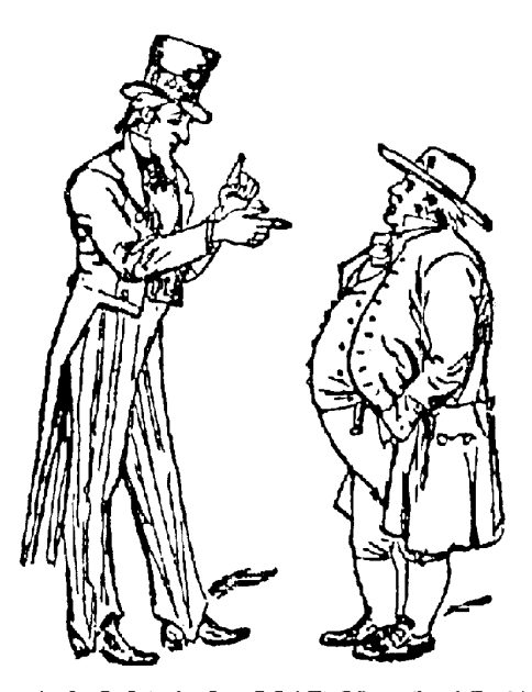
UNCLE SAM & BROTHER JONATHAN