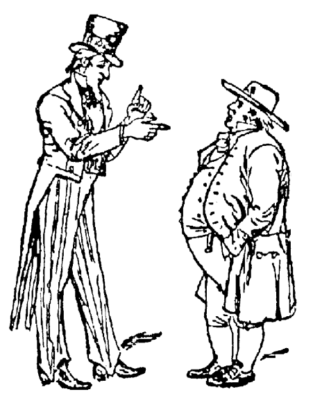
UNCLE SAM & BROTHER JONATHAN