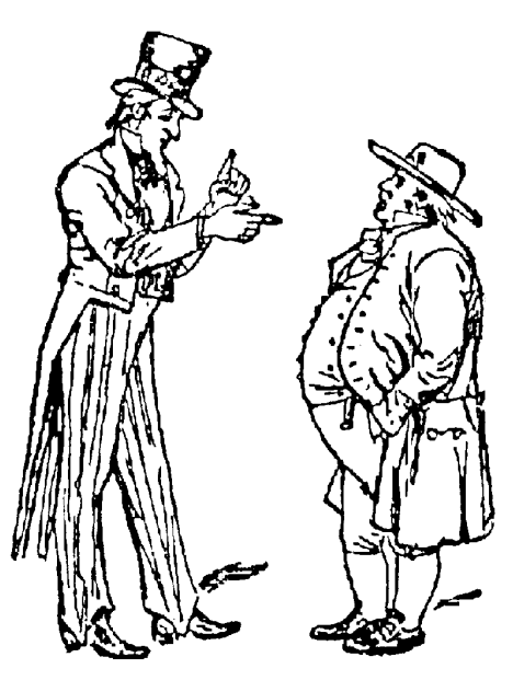
UNCLE SAM & BROTHER JONATHAN