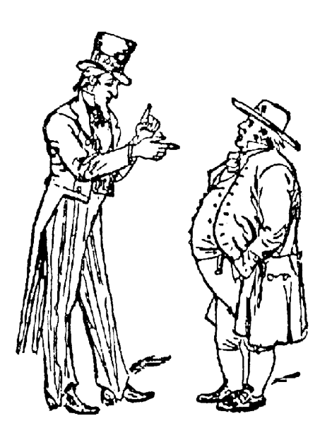
UNCLE SAM & BROTHER JONATHAN