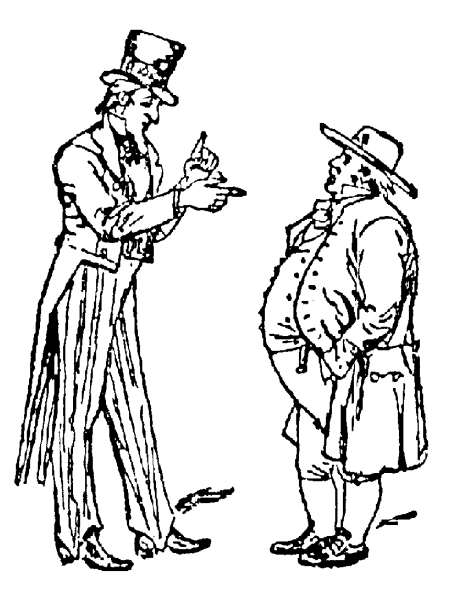
UNCLE SAM & BROTHER JONATHAN